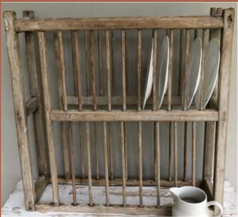
English Antique plate racks from around 1880