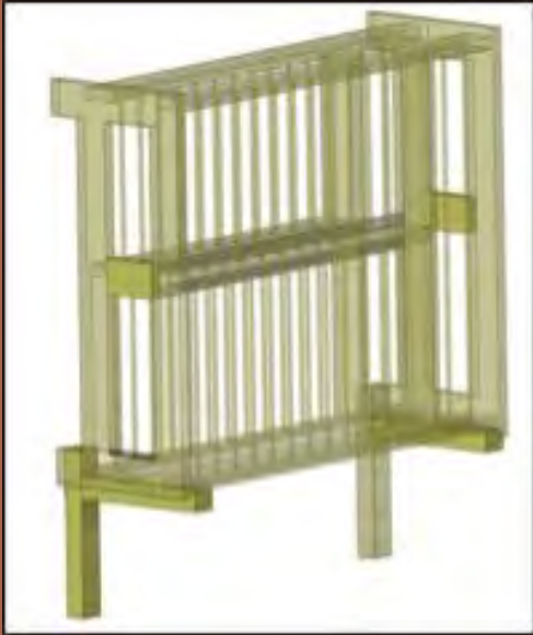
The 3D Image in Progress