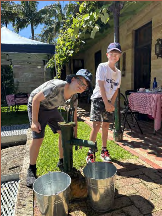
It was fun for the boys learning to pump water for the scullery copper as it was done in the 1880s!