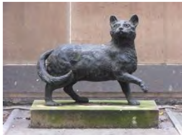
Statue of Trim at Macquarie Street, Mitchell Library, Sydney