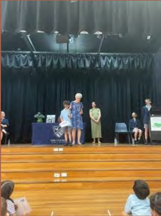
Lane Cove West History Prize Presentation Day