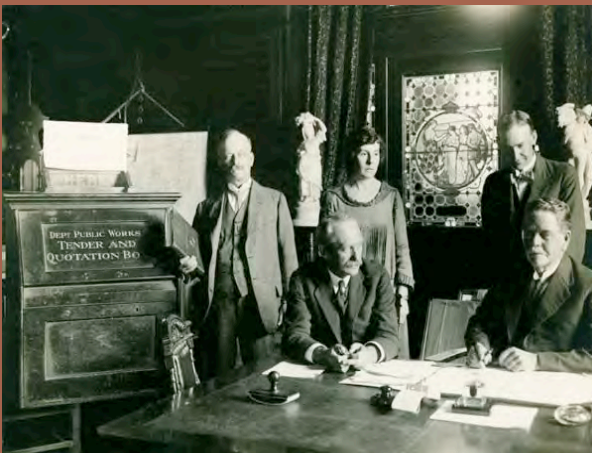
Opening of tenders for the Sydney Harbour Bridge